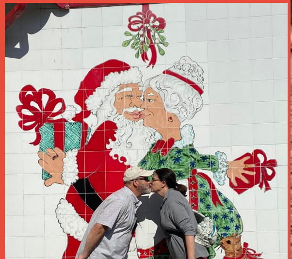
This picture taken in North Pole, Alaska at Santa's House. When in Alaska, you should definitely check it out!

As our churches begin their Christmas celebrations, we hope you will continue to pray that their ministries will be productive and increase the kingdom. Our pastors are deeply